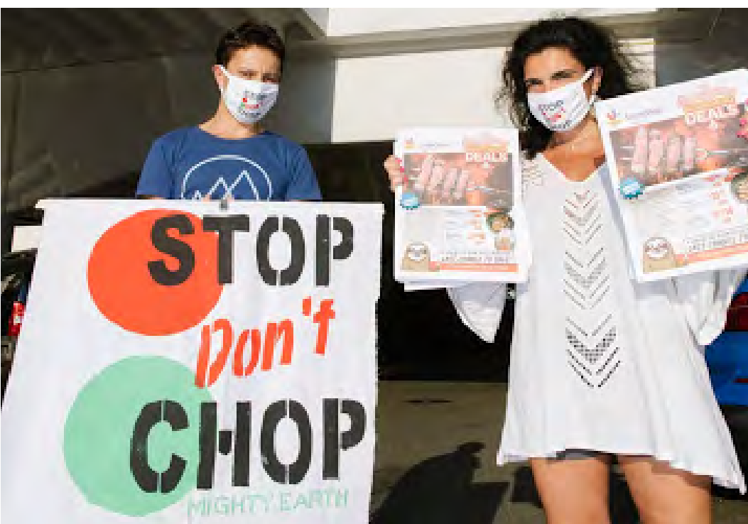
Volunteers deliver comments to Stop & Shop asking them to protect forests by cutting ties with Cargill.

Overall, Angie and Hayley built grassroots pressure on some of Cargill's biggest customers and raised the visibility of the issue to the public and key stakeholders through the media. While Cargill has yet to end deforestation in its supply chain or adopt more sustainable practices, our work helped to elevate the issue and build a grassroots base that will continue pressuring one of the largest, most powerful agribusinesses in the world to do its part to protect our planet.