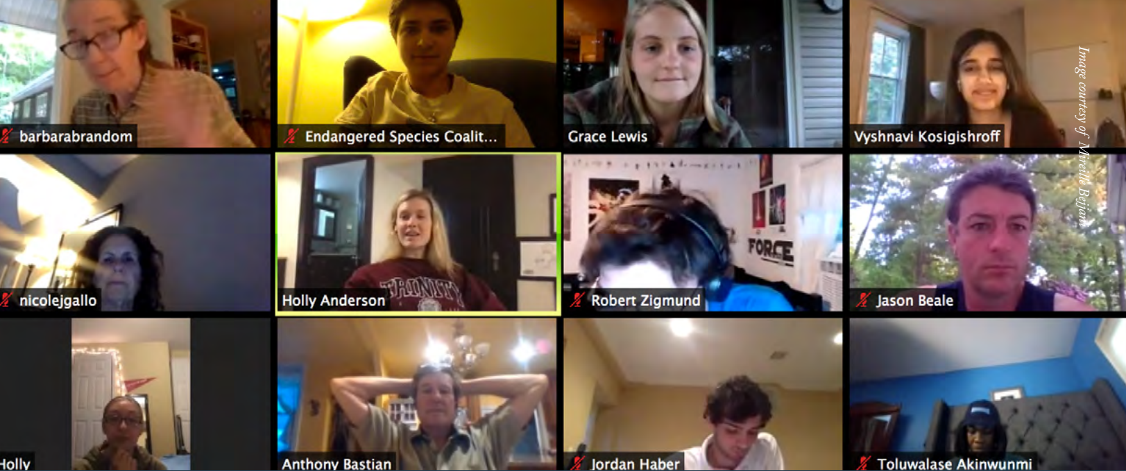
Volunteers gather over Zoom for a campaign action meeting focused on Pennsylvania wildlife corridors.