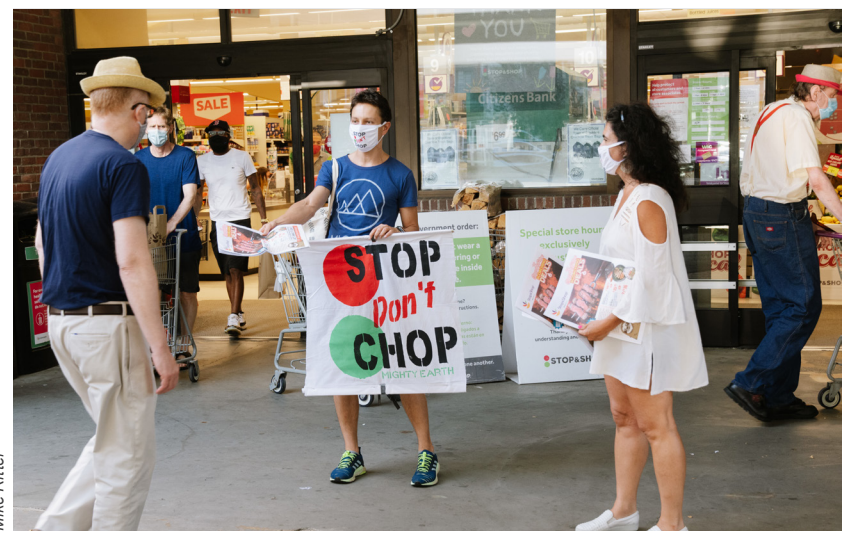
Volunteers campaign at a Stop & Shop in Massachusetts, calling on the company to protect forests by cutting ties with Cargill until it fulfills its commitment to adopt sustainability practices across its entire supply chain.

In all, Angie and Hayley engaged more 40 volunteers, put grassroots pressure on some of Cargill's biggest customers, and helped elevate the issue and build a people-powered base that will keep urging one of the largest, most powerful agribusinesses in the world to do its part to protect our planet.